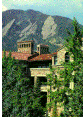
University of Colorado at Boulder

The Kingdom of Boulder - 20 miles north of Denver, the city of Boulder, surrounded by a government mandated green belt, houses the University of Colorado, the Federal Bureau of Standards, and the National Atmospheric Research Center.