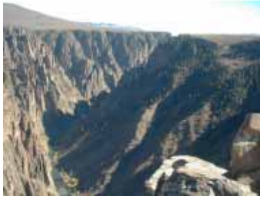
Black Canyon of the Gunnison

canti National Recreation Area, Mesa Verde National Park, the Great Sand Dunes and Dinosaur National Monuments, Colorado National Monument, and the Black Canyon of the Gunnison National Monument.